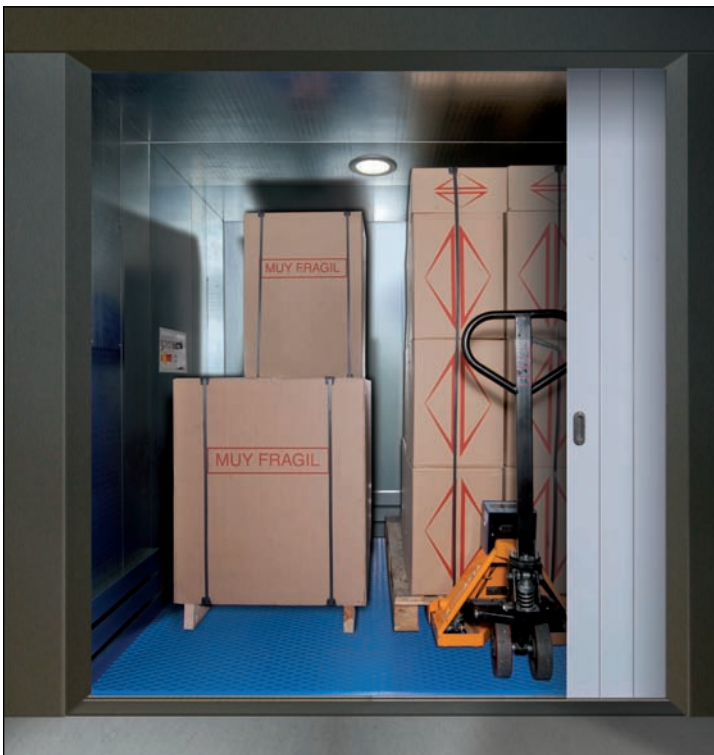
Conventional goods lift mode. The load can take up more space, and the lift is operated from the button displays on the different landings, requiring the presence of an operator on each floor or one moving between landings externally.